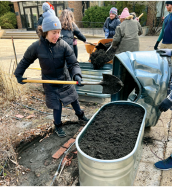
A volunteer works in a garden as part of a food justice and sustainability program, one of the many volunteer opportunities offered through JUF's TOV Volunteer Network.

Rooted in a belief in collective action and collective responsibility, JUF provides life-saving services and life-enriching experiences where they are needed most, including refugee resettlement, food assistance, and housing support.