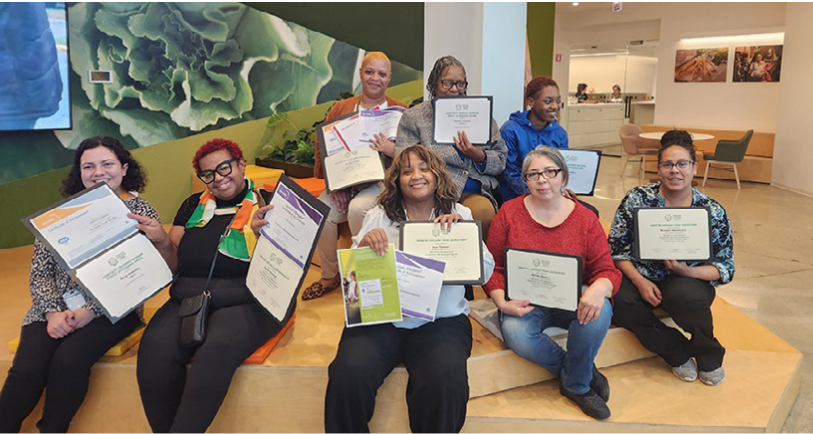
Class graduates pose with the hospitality industry certifications they earned during the class.

Workforce development programs evolve while staying true to the organization's mission to end hunger. To achieve this mission, the Food Depository works with a network of community-based organizations and individuals to connect neighbors with healthy food, facilitate workforce development, and advance solutions that address the root causes of hunger – poverty, systemic inequity, and structural racism.