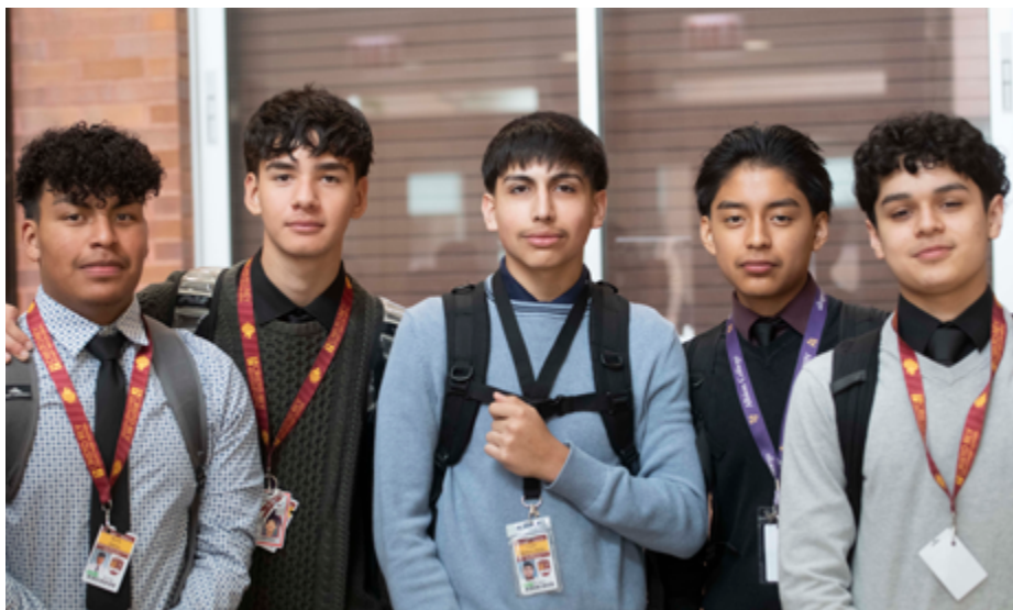
Members of the Class of 2026.