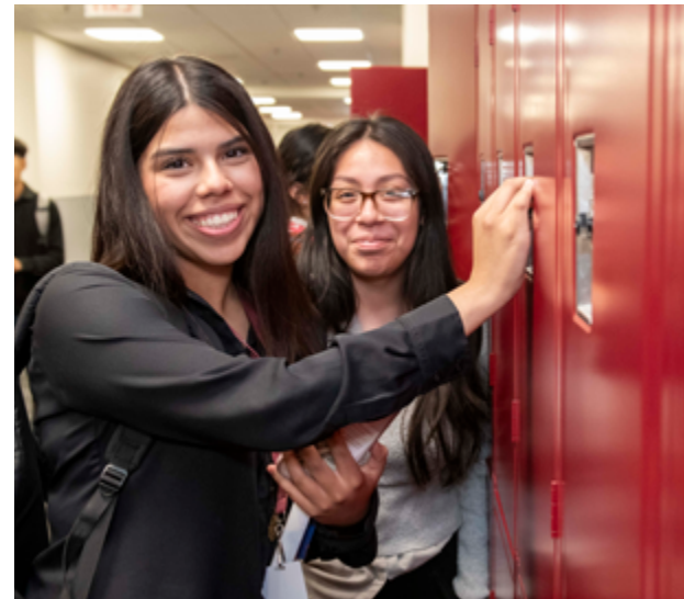
Sophomores are all smiles on the first day of school.