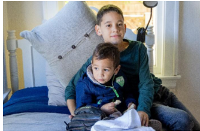
Two brothers gather in their new room. Their family was one of the 130 families housed by through the Parish Family Sponsorship Program.