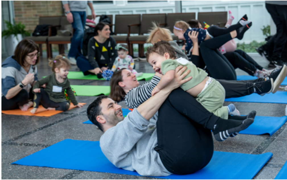
A baby yoga class for toddlers and their families was one of the many examples of how people of all ages safely participated in Jewish life with the help of JUF security.