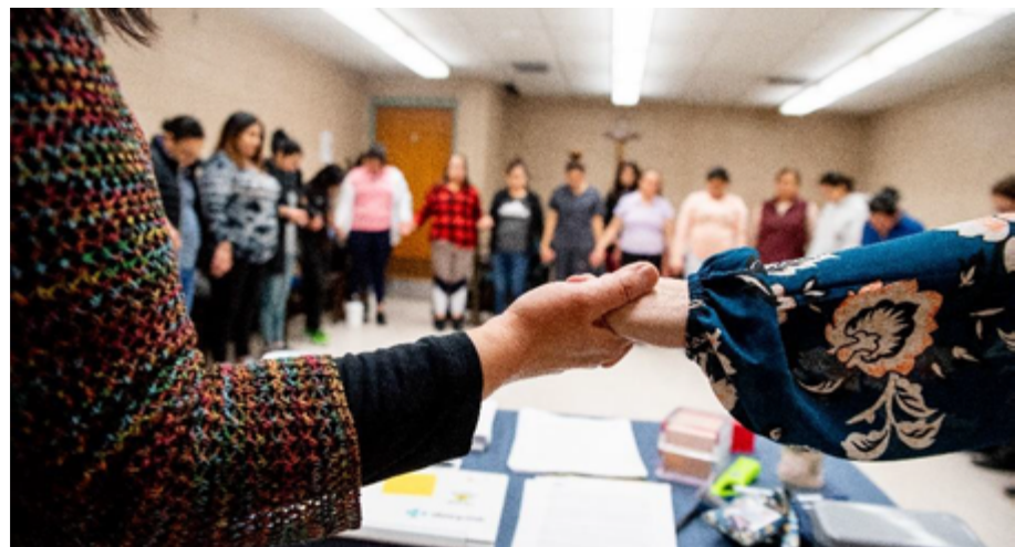
A domestic violence (DV) aftercare group comes together in community.