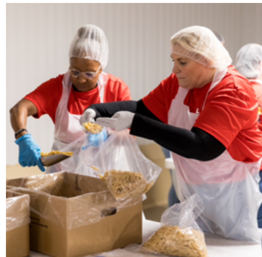
LP team members participate in a food-packing event at Greater Chicago Food Depository.