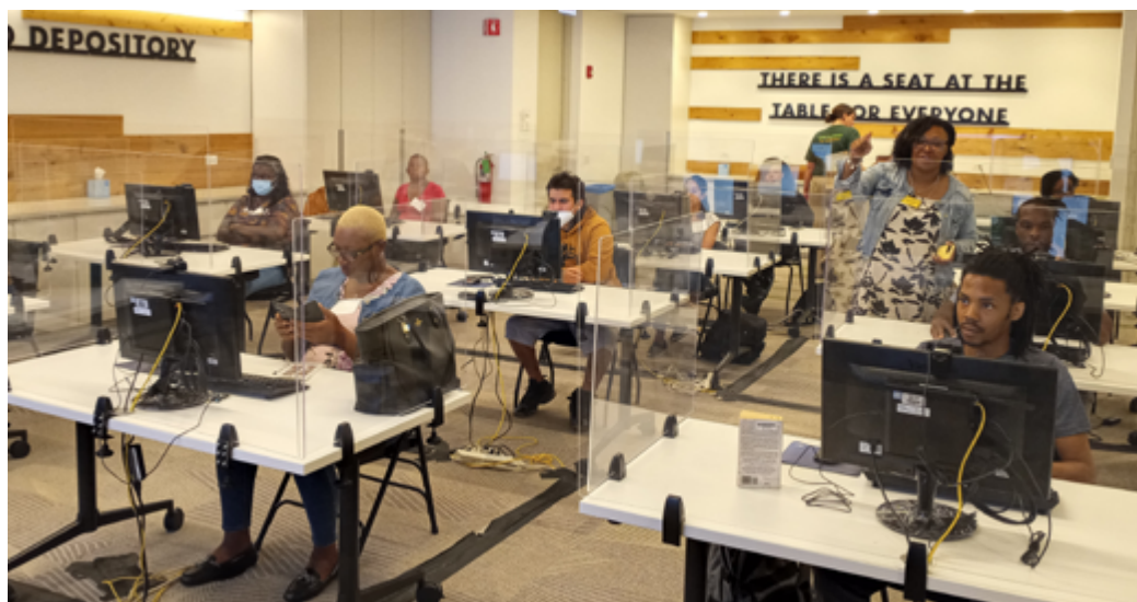
Participants have access to training in digital literacy.

Photos and quotes for this story were provided by the Greater Chicago Food Depository.