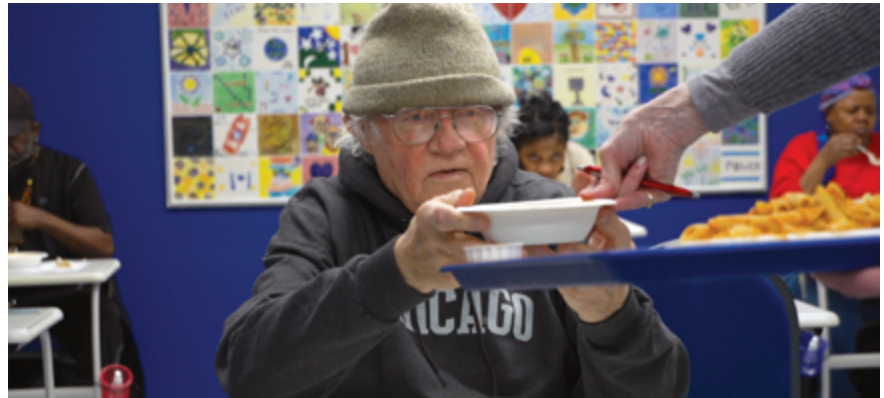
At the JUF Uptown Café, volunteers serve meals in a restaurant style setting, fighting hunger while creating a sense of community.