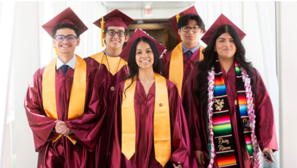
Class of 2024 graduates are now 99% enrolled in college, including University of Notre Dame, Cornell University, Marquette University, Middlebury College, Northwestern University, Providence College, and University of Illinois.

Working with LP, Cristo Rey Jesuit students gain valuable job-readiness skills and work experience along with a tuition scholarship.