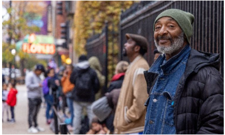
Guests line up for the Sister Joyce Dura, O.S.F., Supper Program at 721 N. LaSalle.