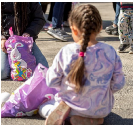
A scene from the HGS annual Easter egg hunt.