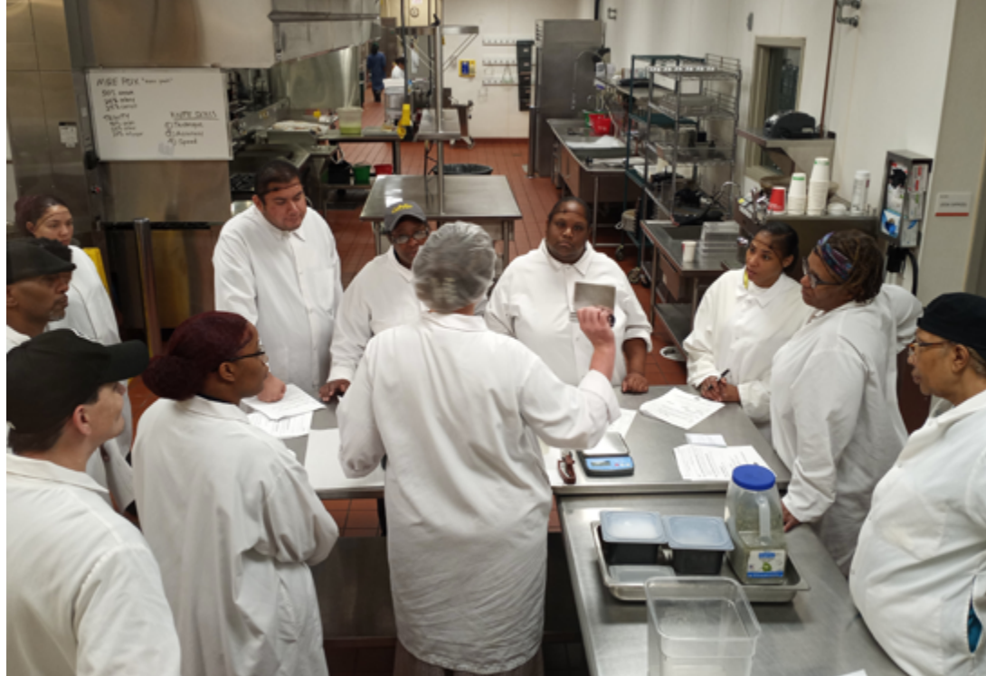
Participants appreciate all the hands-on opportunities in the kitchen.

mindset allows participants to pursue opportunities they may not have thought were for them before training. As the move into employment, it brings more economic stability to their lives and their families. Some even inspire their family members to follow in their footsteps. We had a gentleman complete the Hospitality training program and get hired at a prominent hotel company. His young son attended and completed the program and found his direction and discipline to return to college to complete his education and find work while doing so. With just these two individuals back to work, and one of them enrolled in higher education, the economic growth impacts ripple outward from the individual to their community.