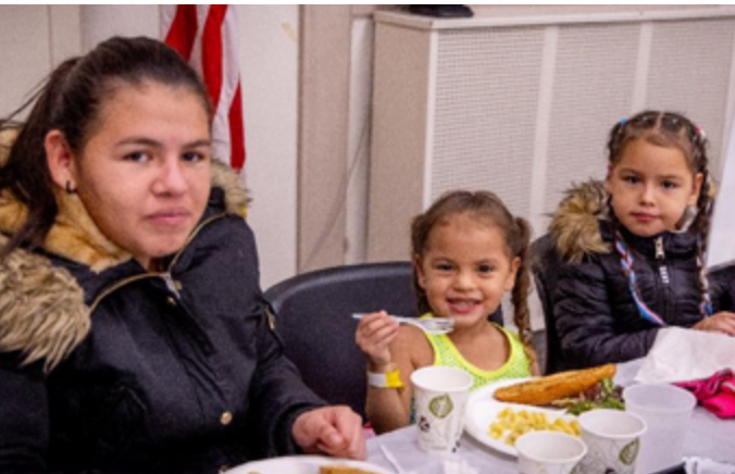
A mother and her children gather for a meal at the Sister Joyce Dura, O.S.F. Supper Program.

Catholic Charities is the largest human services provider in the Chicagoland area. The organization provides services that address the growing food insecurity in our region, new arrivals from Venezuela and other countries who are scared, hungry, and in search of a more stable life, and opportunities for mothers and children who have been impacted by domestic violence.