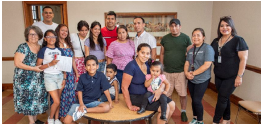
Migrant families gather on the campus of St. Gall Parish in Chicago for education on employment, housing, and legal matters. This class is designed to assist them in their resettlement.