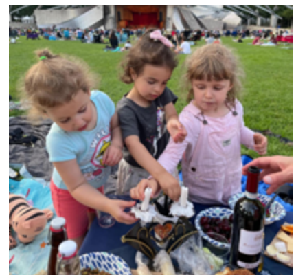
Left: JUF created opportunities for young adults to connect to community, from Shabbat dinners to cocktail hours to volunteer opportunities, such as this volunteer mission to Israel. Right: Toddlers light Shabbat candles at a JUF Russian-speaking Jewish Division program, one of countless examples of how Jewish life in Chicago still flourished in a challenging year.